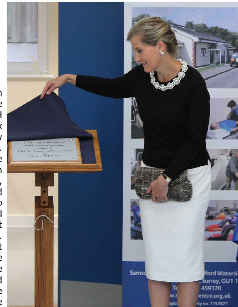
HRH The Countess of Wessex opening our new Physiotherapy Suites